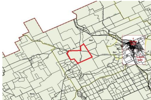
Waterhatch located approximately 10 Km west of the town of Beverley

Waterhatch is a 959.1 hectare (2,370 acre) mixed crop, sheep and cattle farm situated approximately 10 Km west of the Avon Valley town of Beverley Western Australia. It straddles the cross roads of Waterhatch-West Talbot Road and the York-Williams Road.