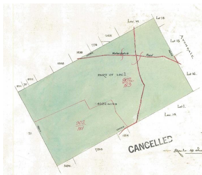
Plan from 1913 Title