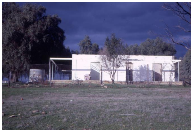
The house after the fire

The Waterhatch farm house was destroyed by fire on Sunday 16 October 1966 while the family was at the Dale for a cricket match 15 .