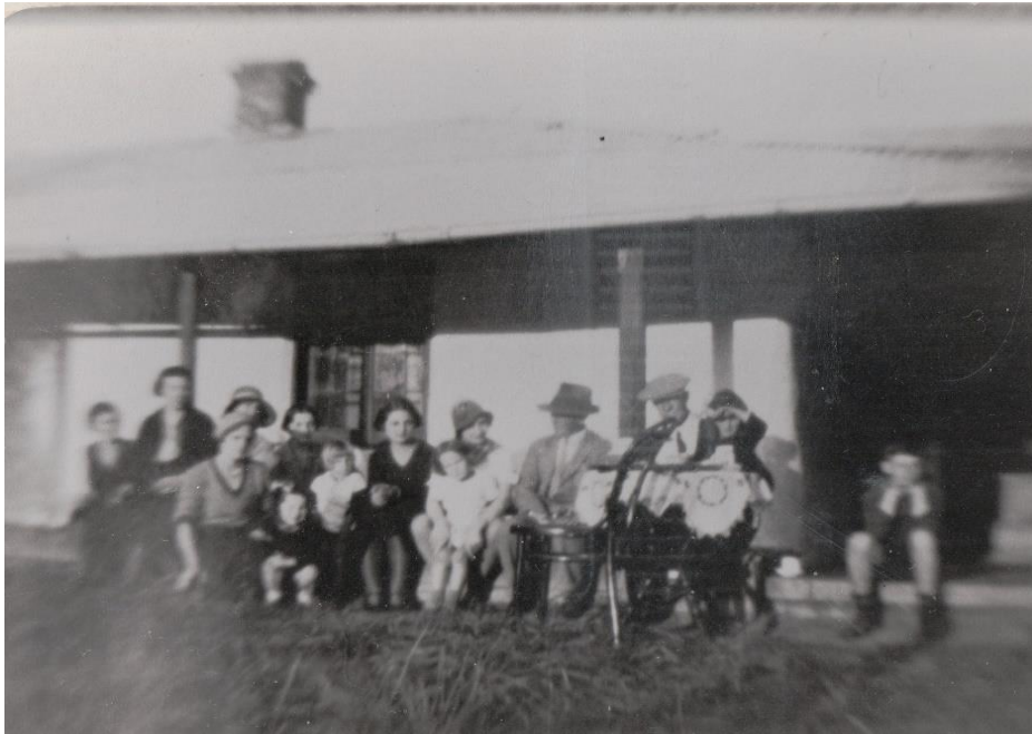
Waterhatch (clay brick) homestead circa 1920