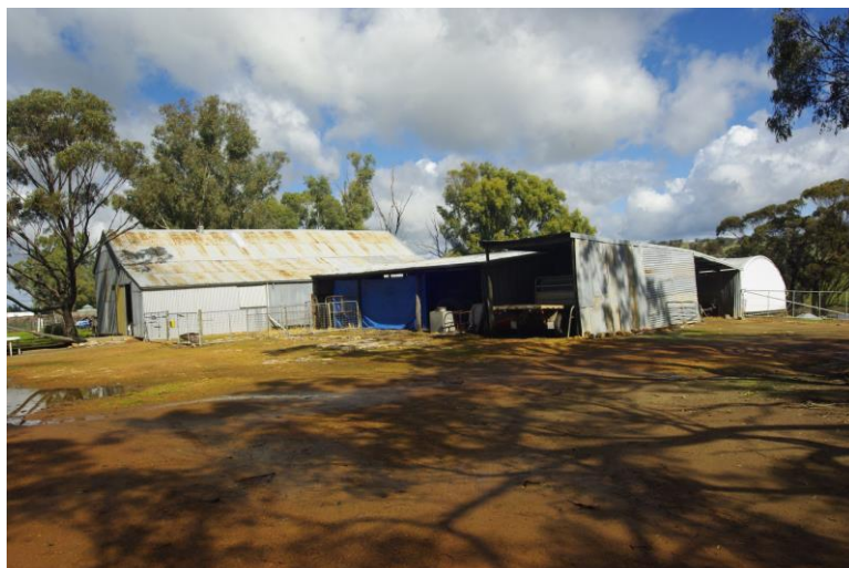
Shearing shed and old stables (2017)