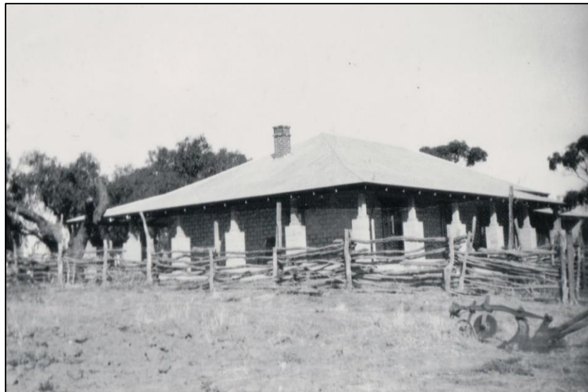
Waterhatch homestead made from cement bricks

On 30 November 1939 a willy-willy partially destroyed the old Waterhatch house made from clay bricks (on the property). The new house was built with cement bricks. 9