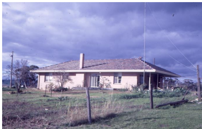
The current house built in 1968

The third Waterhatch farm house was built in 1968. It was a very dry year in 1969 with crops failing and only just enough grain being harvested for seed. Grain & hay needed to be purchased to feed the sheep & cattle 16 .